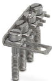
Switching jumper, pitch: 8.2 mm, number of positions: 4, color: silver

Please be informed that the data shown in this PDF Document is generated from our Online Catalog. Please find the complete data in the user's documentation. Our General Terms of Use for Downloads are valid ( http://phoenixcontact.com/download )